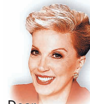
Dear Abby ADVICE

DEAR ABBY: In recent years it seems cheating is encouraged by parents. I have seen it when teaching Sunday school to seventh-graders. The father of one of the Scouts in our local Scout troop even called cheating "just a form of competitive advantage."